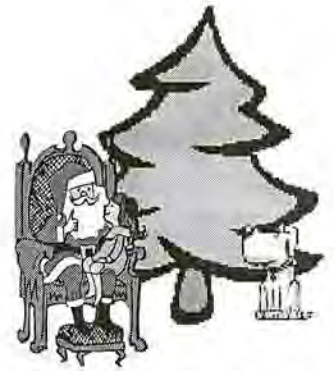
Tree Trimming Dec 9